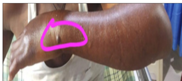
Figure 5. Small Blister in Case No. 15 (RV Bite) after Use of Herbal Spray that Resolved Spontaneously