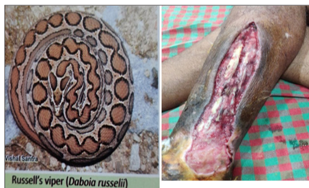
Figures 3&4. Russell's Viper 11 and its Bite Causing Sloughing of Tissues

Among the 15 patients, 11 were bitten by Russell's viper, two by common krait and one each by saw-scaled viper and green pit viper. All patients came to the clinic within 30 minutes to 3 hours after getting bitten. Apart from routine clinical treatment including ASV and parental antibiotics, all were sprayed with the herbal spray solution. Around 5 to 30 vials of ASV were used. None of them except two developed mild blisters and no sloughing of muscles in the bitten part was observed. All patients were discharged without skin grafting or amputation within 3-13 days of admission. Earlier, despite local cleaning of the bitten area with betadine and spirit, ASV and antibiotics use, blisters used to appear within five days, especially in cases bitten by Russell's viper (Figures 3 & 4). Now after addition of the herbal spray this time, all of them except two, had mild blisters (Figure 5) that resolved without a deep wound. All were saved from sloughing of the bitten part sparing them from skin grafting or amputation. Details of the patients are tabulated in Table 1.