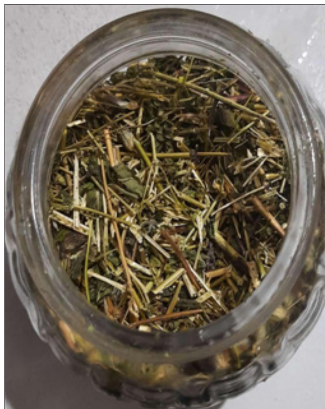
Figure 1. Dried Parts of Herbal Plant