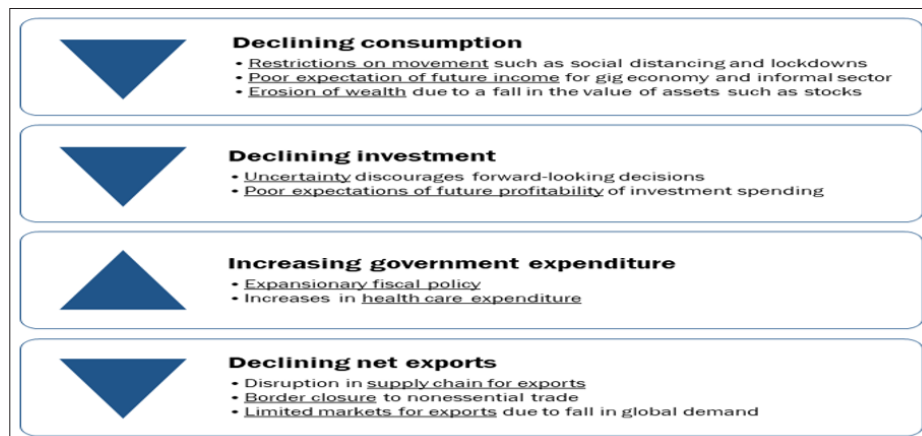
Figure 2.Economic Crisis blocks of COVID-19