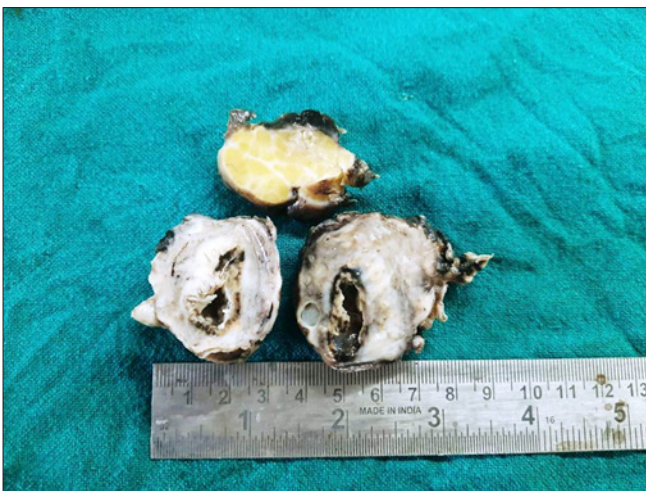
Figure 2. Hematoxylin and Eosin Stained Section revealing many Scattered Foam Cells in Ovary (40x)