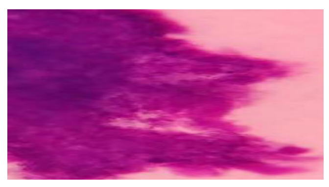
Figure 2.Undulating amorphous membranous material seen on cytology

abdominal wall swelling was performed in the Department of Pathology which revealed paucicellular smears with an isolated hooklet like structure and some amorphous eosinophilic membrane like material on a clear background. Correlating clinical findings with FNAC findings, a diagnosis suspicious for parasite? Cysticercosis (Figure 2) was given and an excision biopsy was advised. The lesion was excised and sent for histopathology which revealed presence of eosinophilic sac like wall of the parasite admixed with inflammatory cells thereby conferring a final diagnosis of cysticercosis of the skeletal muscle primarily (Figure 3a, 3b).