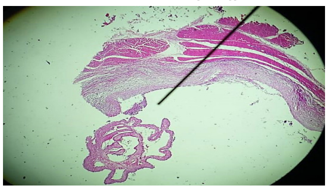
Figure 3(A).Scanner (10x) view of the cysticercosis wall with surrounding fibrosed tissue